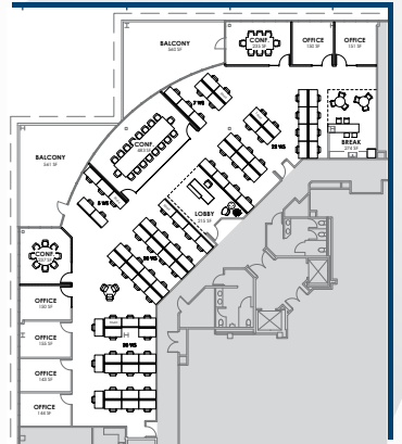
*HYPOTHETICAL TESTFIT SUITES 350 & 370 - ±8,738 SF